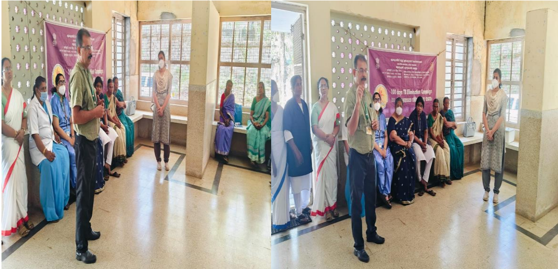
19.02.2025-Camp at ESI dispensary